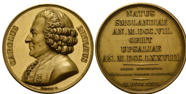
Fig. 10. Brettauer no. 678.