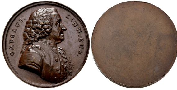
Fig. 5. Brettauer no. 666.