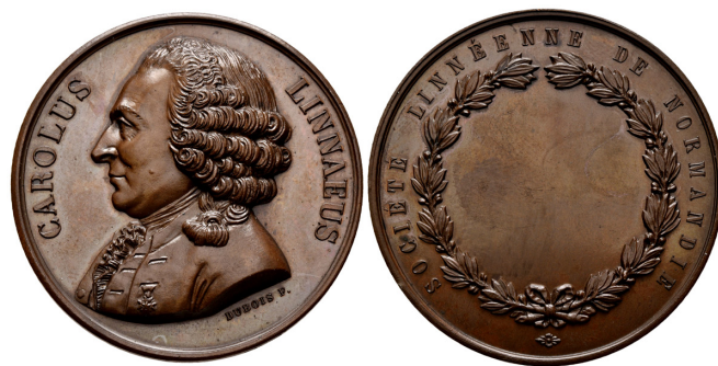
Fig. 12. Brettauer no. 682.

Brettauer Collection 681. Silver, struck; 42.1 mm; 35.34 g. Punched on the edge: (pipe) 33 ARGENT. Old inv. no. 4678 (Bukowski 11.25). Brettauer Collection 681.a. Bronze, struck; 42.1 mm; 32.12 g. Punched on the edge: (pipe) 34 BRONZE. Old inv. no. 3830 (Bukowski 3.45).