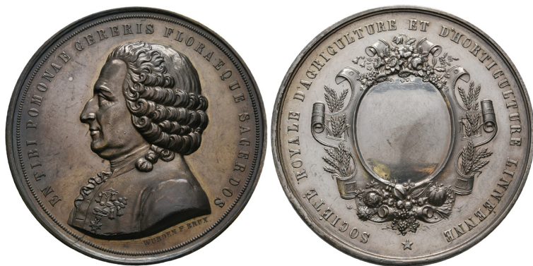
Fig. 15. Brettauer no. 690.