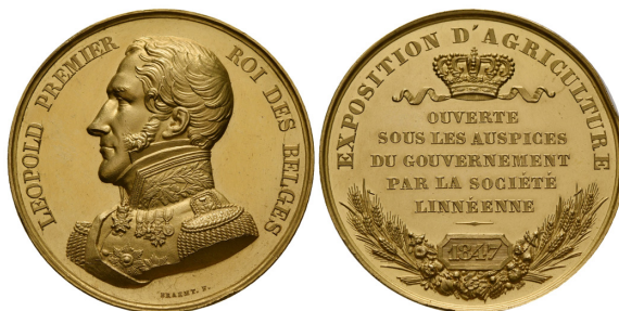
Fig. 14. Brettauer no. 687.

local society. This function, I think, had the Société d'ethnographie de Paris, founded in 1859. Wiséhn p. 73, 119 (bronze); Klackenberg p. 34-35, 38. Brettauer Collection 685. Bronze, struck; 42.1 mm; 32.32 g. Punched on the edge: (bee) 39 CUIVRE. Old inv. no. 4183 (Cahn 1.20) (Fig. 13).