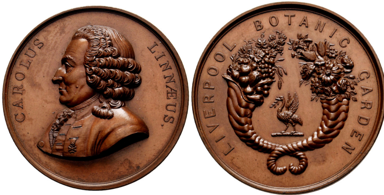
Fig. 7. Brettauer no. 670.