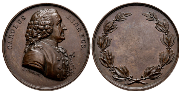
Fig. 9. Brettauer no. 674.

673. Medal, undated, by William Joseph Taylor (1802-1885; signed W. J. TAYLOR. and W.J.T.). The medal is from the same obverse die which has been used for no. 672, but now in combination with a neutral reverse die, also with a free central field. Wiséhn p. 86, 153 (silver, bronze); Hyckert I, p. 263, 33. Brettauer Collection 673. Bronze, struck; 50.8 mm; 57.98 g. Old inv. no. 4676 (Bukowski 21.75).