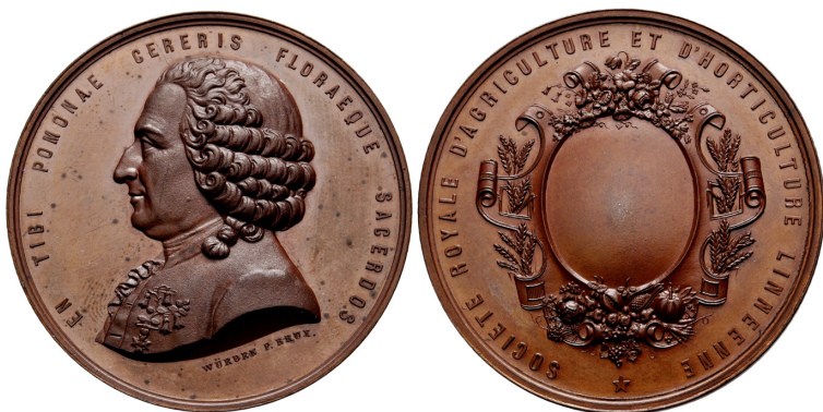
Fig. 16. Brettauer no. 691.