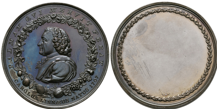
Fig. 8. Brettauer no. 671.