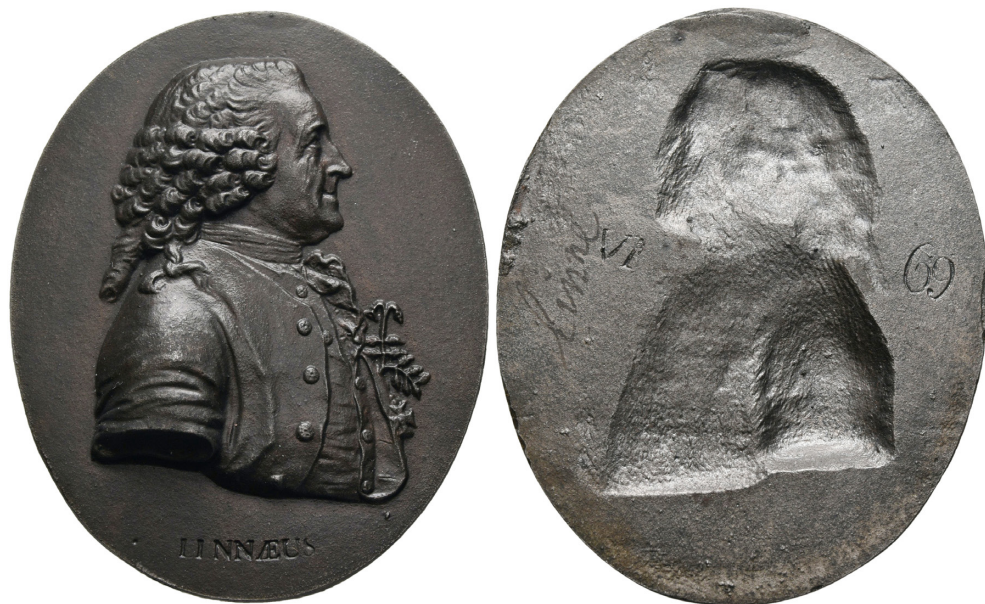
Fig. 4. Brettauer no. 665.

be the Swedish consul in Birmingham. Wiséhn p. 22-23, 4 (bronze, tin); Hyckert I, p. 253, 8, pl. 46, 1. Brettauer Collection 668. Tin, struck; 48.5 mm; 34.79 g. Old inv. no. 232 (Hamburger 2.50).