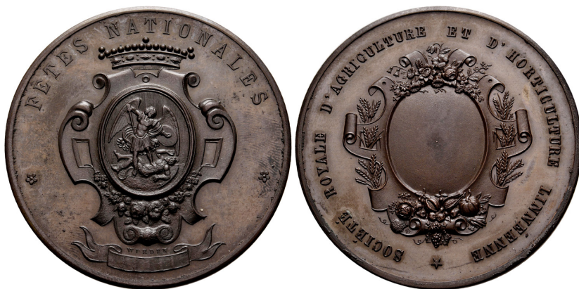
Fig. 17. Brettauer no. 692.