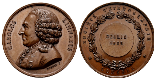
Fig. 13. Brettauer no. 685.