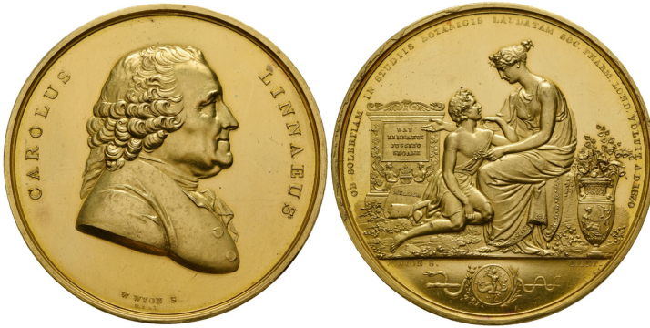
Fig. 6. Brettauer no. 667.