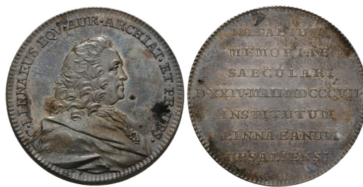
Fig. 3. Brettauer no. 663.

665.* Oval medallion, undated (about 1805-1830), iron cast from Gleiwitz (Gliwice, Silesia, Poland), after a Wedgwood medallion by John Flaxman (1755-1826) 19 , on the reverse engraved: VI - 69 and inscribed Linné. The engraved numbers on the reverse indicate series VI number 69 in the production of the Gleiwitz iron foundry. The model probably was a Wedgwood porcelain medallion (Wiséhn 15-21). Wiséhn p. 30, cf. 24 (tin, larger) and 25 (iron, without LINNÆUS inscription under the bust). Hintze